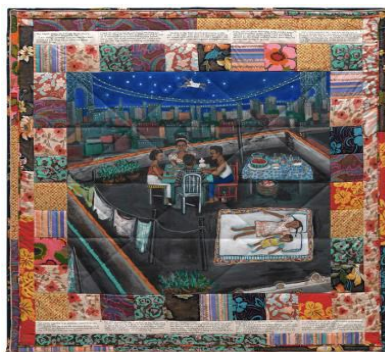
'Tar Beach' by Faith Ringgold